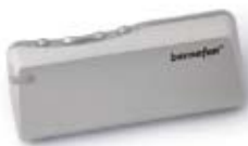
RC-P remote control

A special TV adapter is also available to enhance your perception of TV audio. A telephone adapter can improve your ability to hear land-line calls. Both accessories communicate with the hearing system through the SoundGate.